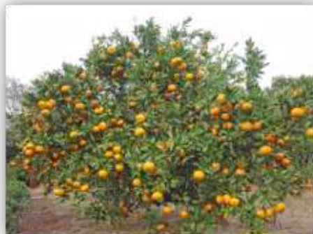
Citrus unshiu (温州ミカン 360 Mbp)