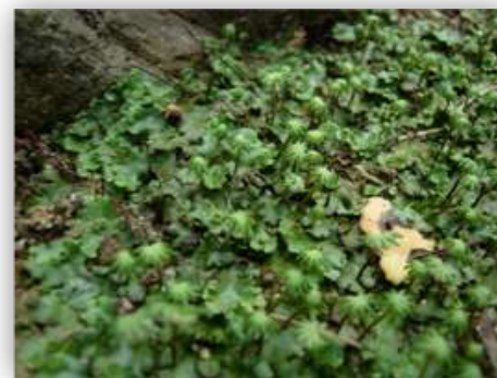
Marchantia polymorpha (基部陸上植物・ゼニゴケ 220 Mbp)