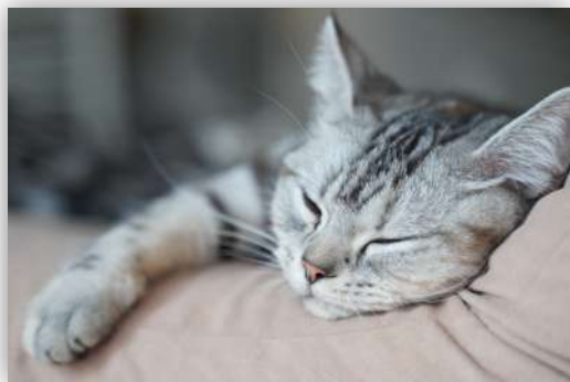
Felis catus (イエネコ 2.5 Gbp)