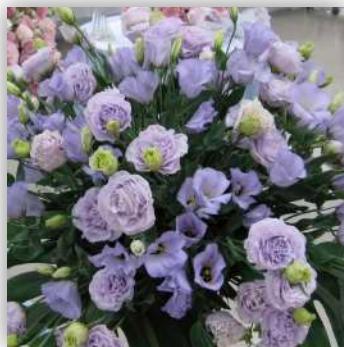
Eustoma grandiflorum (トルコギキョウ 1.4 Gbp)