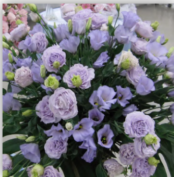
Eustoma grandiflorum (トルコギキョウ 1.4 Gbp)