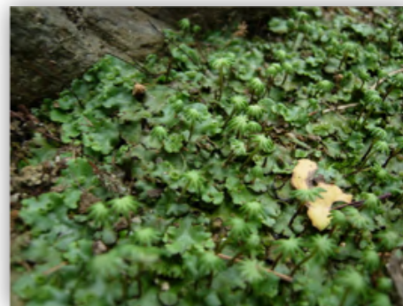
Marchantia polymorpha (基部陸上植物・ゼニゴケ 220 Mbp)