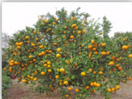
Citrus unshiu (温州ミカン 360 Mbp)